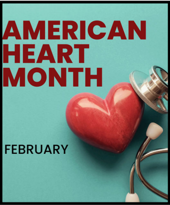
February is Heart Month