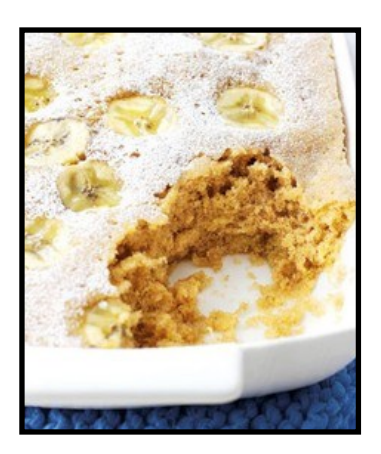
Enjoy Microwave Banana Pudding!