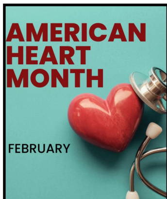
February is Heart Month