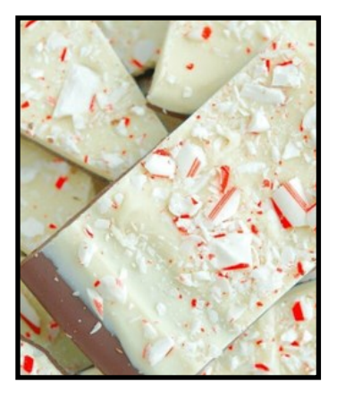
Enjoy some peppermint bark!