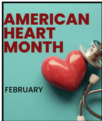
February is Heart Month