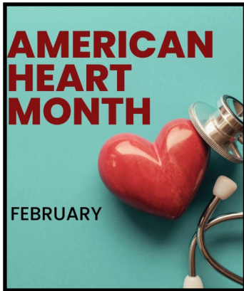
February is Heart Month