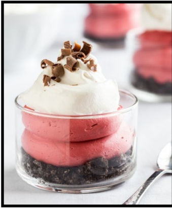
Red Velvet Cheesecake for Valentine's Day!