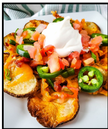
Irish Nachos for St. Patrick's Day!