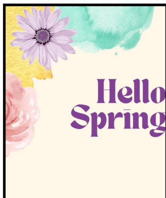
First Day of Spring is March 19th!