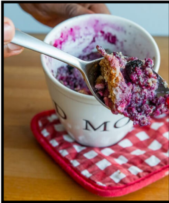
Try some Berry Cobbler!