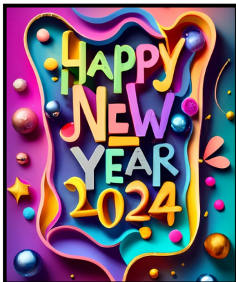
Let's Ring in this New Year Together!