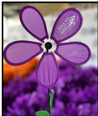
Learn more about Ending Alzheimer's Movements and Involvement