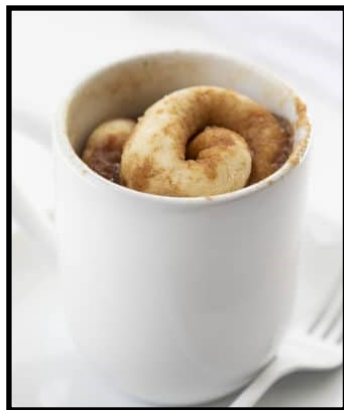
Enjoy a Cinnamon Roll in a Mug