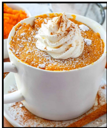
Pumpkin Mug Cake Recipe