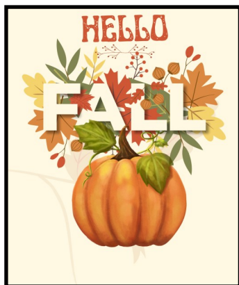
Fall is here!