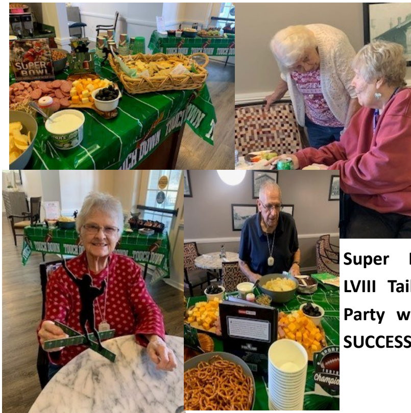
Super Bowl LVIII Tailgate Party was a SUCCESS!!!