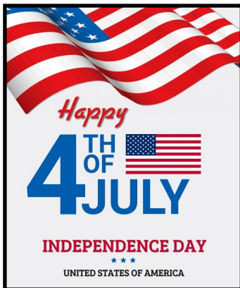
Independence Day is Tuesday July 4th!