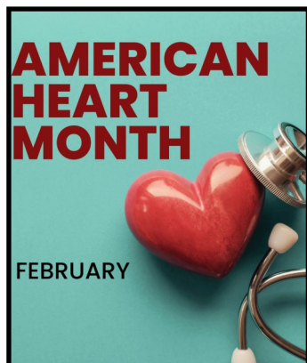
February is Heart Month