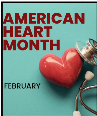
February is Heart Month