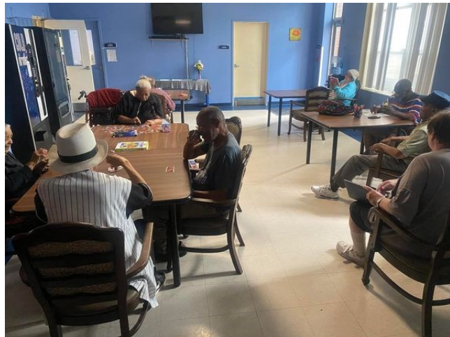
Table Games every Thursday @ 1:00pm