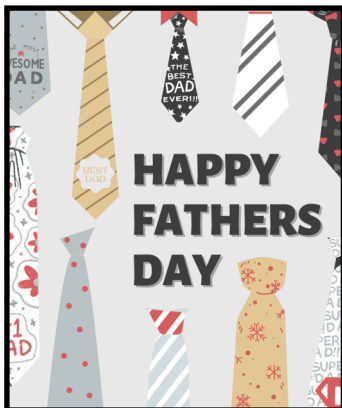
Father's Day is Sunday June 18th!