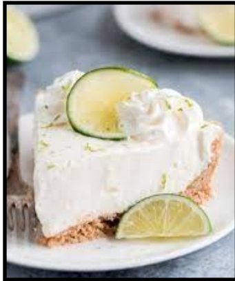
Key Lime Pie Time!